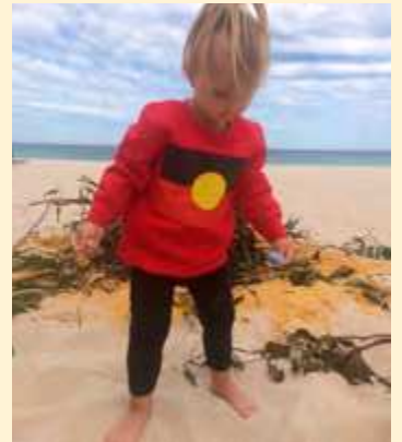
SKHKAC younger generations descendant supporting the cultural Welcome to Country ceremony on Scarborough Beach.