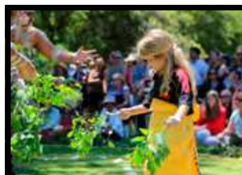
Mungart Yonga Cultural Group – a highlight of Opening the event, where our younger generations danced to the sounds of the didgeridoo