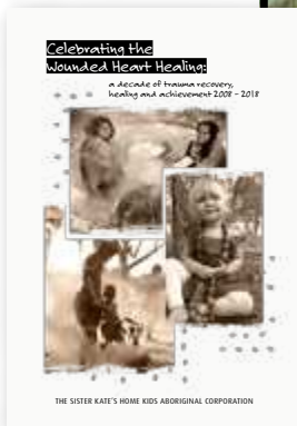
Above: Oral History publication; Celebrating the Wounded Heart Healing 2008-2018 - a highlight for SKHKAC and their families

Mili Mili Wangkiny - Gulluk Moort Kadicijini | Paper Talking - sharing news with our family