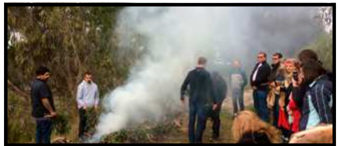
Smoking Ceremony in Country to initially start the series of Cultural Awareness programs where WSP Executive Management staff attended July 2018.

SKHKAC are soon to participate in a series of discussions with WSP and several major corporate organisations who work in partnership with them on a range of projects in the metro area and throughout regional Western Australia, around possible development of a same