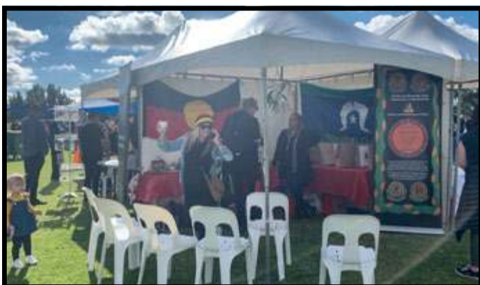
SKHKAC marque at City of Bassendean NAIDOC Week Event, Ashfield Oval

Once again, the Bassendean Shire staged a fabulous event with the many Aboriginal organisations set up on site to share their agency's services with the many Aboriginal families and the wider community who support the event - which has grown in strength over the years. It was SKHKAC's first year to participate in the community gathering, where we set up a Yarning space where staff shared our Corporation's focus in providing healing and counselling services to our SK Homees and our collective families both in the metro area and regional WA and the wider Aboriginal and Torres Strait Islander community.