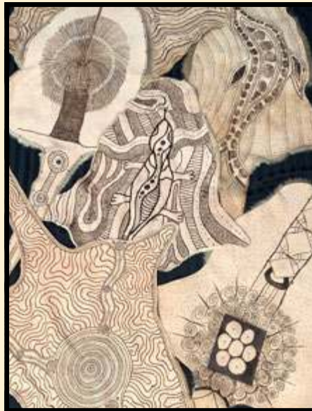
Some great designs on the series of Yonga Bookas which were completed by participants of the workshops.

Following the camps and ceremonies, SKHKAC held a series of four Yonga Booka design workshops, where everyone produced wonderful designs on their Bookas that reflect their name and totem and connection to their place of belonging.