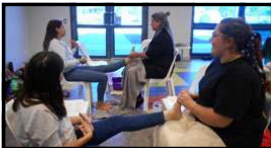
Wildflower Healing Workshop where the women were introduced to healing practices.