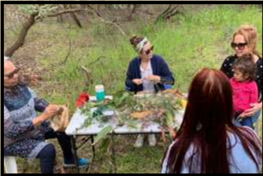
Cultural headdress Workshop – a major component of the women's gathering.

(cultural teaching and learning bush camps)