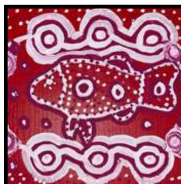
Acrylic on Canvas - "Fish" by Leanne Loo.