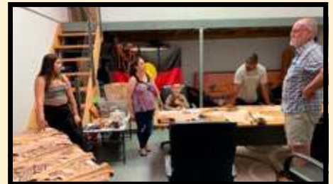
SK Homees and descendants Yonga Booka workshop.