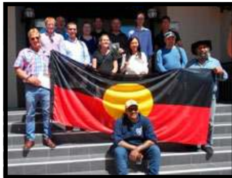
WSP staff group photo completing one of their CAT workshops.