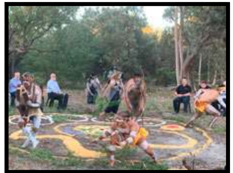
Cultural Ceremony at WSP finale event held on the SKHKAC Bush Block, Queens Park.