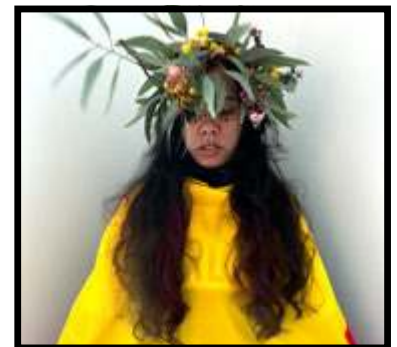
Cultural headdress Workshop; using gum leaves and their flowering seed pods.