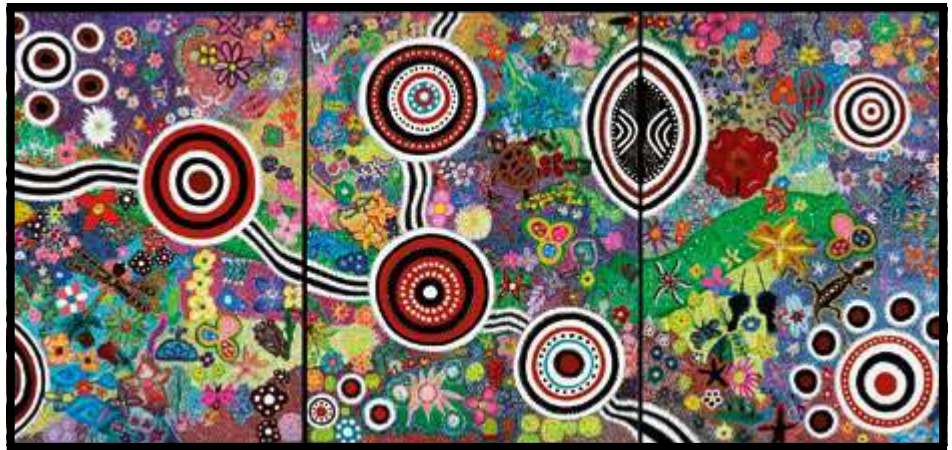
Title: Healing Colours in Country 2019.

SKHKAC was a centre piece of the 2nd National and 2nd International Suicide Prevention Conferences held in Perth in 2018, where the Healing Hub and Art Expression Workshops were a big hit with