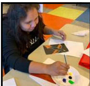
Art and creative expression session in the program.