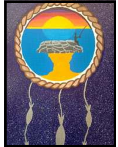
"Dream Catcher" by Nardia Whitehurst

A DVD was produced to document the achievements the women have made in their healing and wellbeing journey, where it also includes a series of interviews by the women, a cultural ceremony, dancing as well as their art exhibition which was a great highlight on the night for everyone.