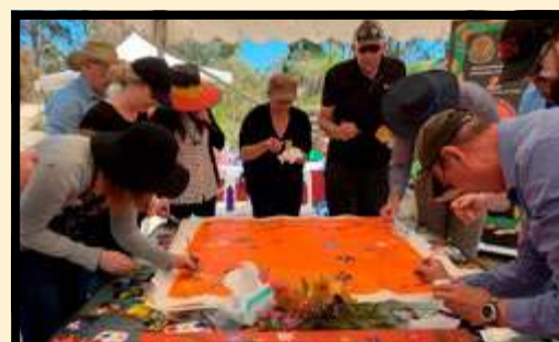
Staff working on their collective art-piece.