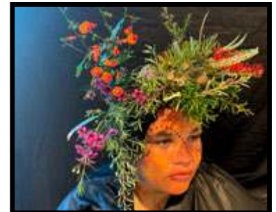
Cultural headdress Workshop; using wildflowers.