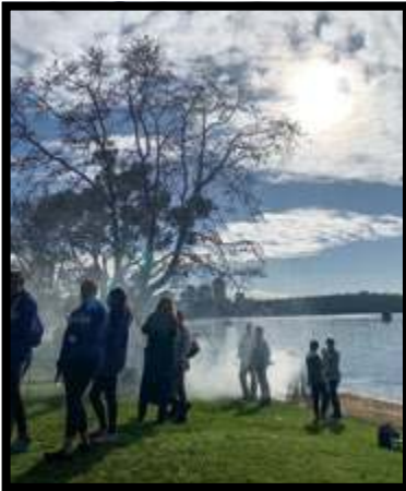
Smoking Ceremony on the banks of the Derbal Yirrgan, UWA.