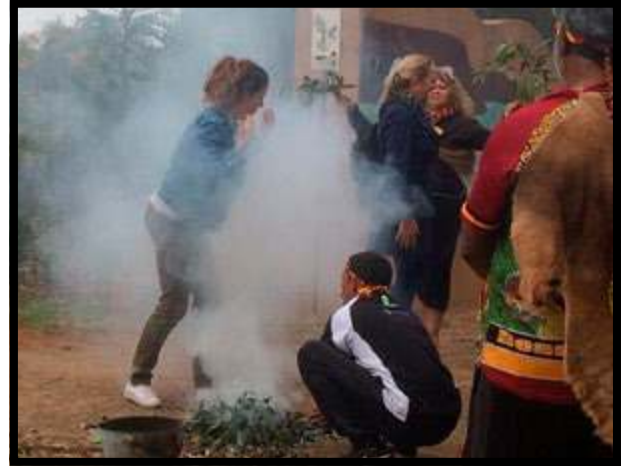
Smoking Ceremony of WSP staff, at one of their CAT workshops held at Yagan Memorial Park, Swan Valley.

The event ended with a cultural dance performance with all WSP and SKHKAC staff and dignitaries celebrating the conclusion of the training with the Njumbi dance.