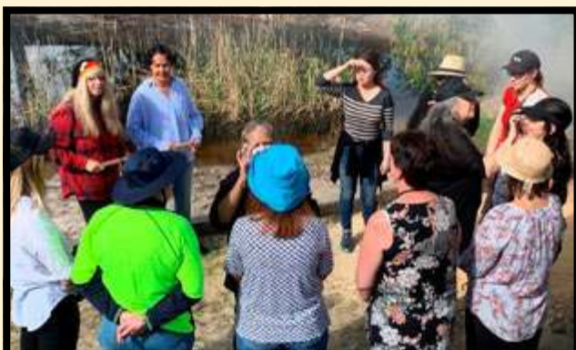
Ochre face painting of women staff members - Main Roads.

The SKHKAC CAT program is proving to be a great success in our program service and delivery and this has been garnered via the evaluation component by both WSP and WA Main Roads staff, highlighting both the effectiveness of our cultural knowledge sharing focuses, creative expression with group art sessions and working collectively to develop high level outcomes within these organisations Reconciliation Action Plans (RAP), to better prepare staff to work with Aboriginal traditional owners in country.