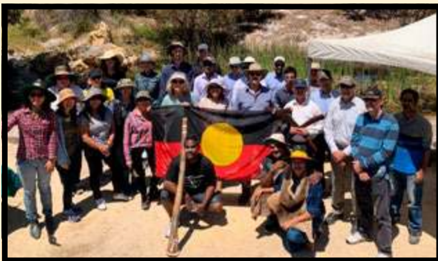
WAMR's staff completing one of their CAT workshops in country - Mariginiup.

Following on the heels of the WSP successful CAT program, SKHKAC have engaged the WA Main Roads for a similar program for their Executive Management Team and their 850 staff in the metro area - where 400 have already completed the training to date, with another 450 to complete it in March and April 2020.