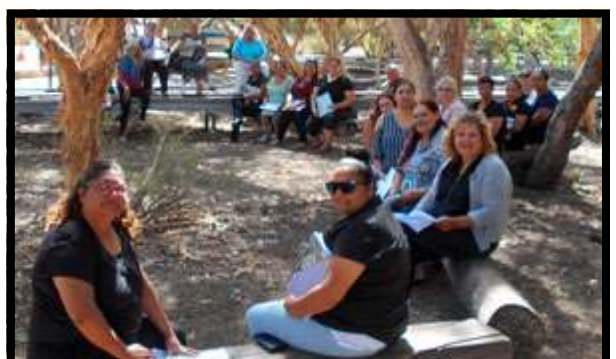
Sitting on Country - Sharing Culture: C&ACH Staff and Health Worker's pre-program workshop, Mills Park, Beckenham.