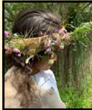
A younger SKHK member – wearing her cultural headdress.

As part of major cultural healing KPIs in our funded programs, SKHKAC delivered several men and women's bush camps, both on the Bush Block and in other parts of Noongar country, which were supported and seen as a valued initiative by both SKHK Islander families and Aboriginal and Torres Strait Islanders and the wider community. Men, women and younger generations gathered to share cultural knowledge, healing practices and protocols generating a sense of connection to culture, country and cultural identity.